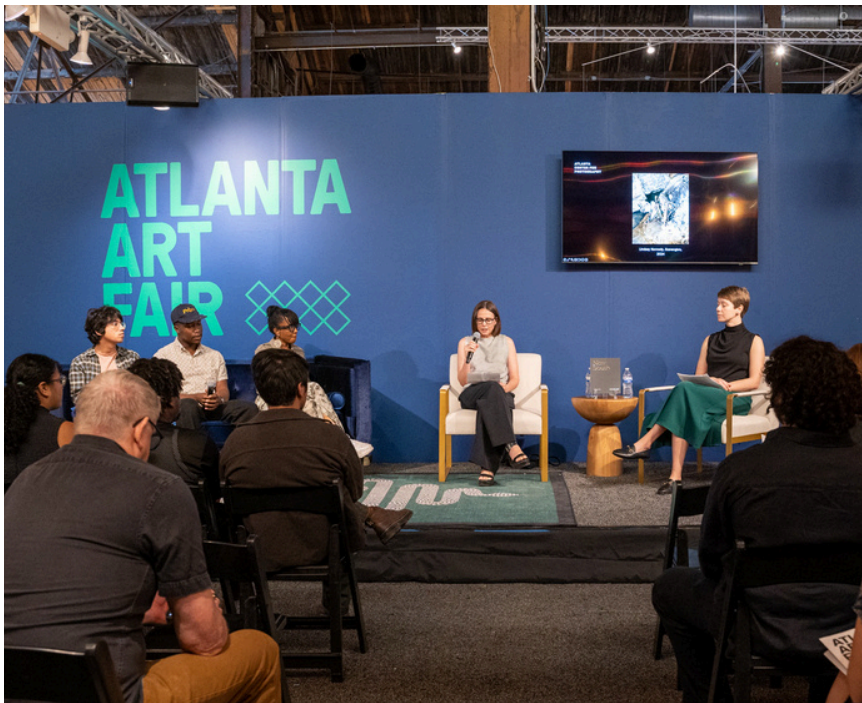
ACP's New South panel discussion and book launch at Atlanta Art Fair, October 5, 2024

Our major, ongoing fundraising campaign has pledges of $230,000 towards our $500,000 goal